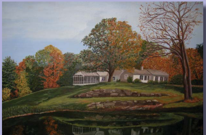
"Vermont House and Pond" 36" x 24" Oil on canvas

In this larger Vermont painting I wanted to display a friend's magnificent house perched at the top of a long grassy slope and nestled into a cluster of trees putting on their fall colors. The challenge, and fun, of the painting was depicting the reflection of the house in the lovely green pond that sits below it. Reflections are ghostly things I learned, but they are fun to capture when they're not looking and you sneak up on them.