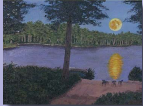
"New Hampshire Moonrise" 16" x 12", Oil on canvas