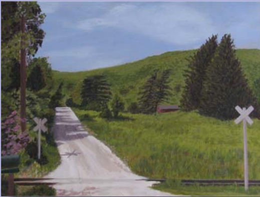
"Vermont Crossing, Spring" 24" x 18", Oil on canvas

New Hampshire has many such beautiful scenes of course, but my favorite New England state for landscape painting is Vermont. I've painted one Vermont scene four times, once for each of the four seasons. "Vermont Crossing, Spring", the view from an old railroad crossing in quiet little Shaftsbury, shows a spring-greening mountain behind grassy fields, bushy pines, a dusty road and, yes, a red farm house. I think the spring painting is the happiest of the four, though the other three seasonal views have their merits. Please look at all four of them in the Landscapes section of my website www.theviewoutmywindow.com .